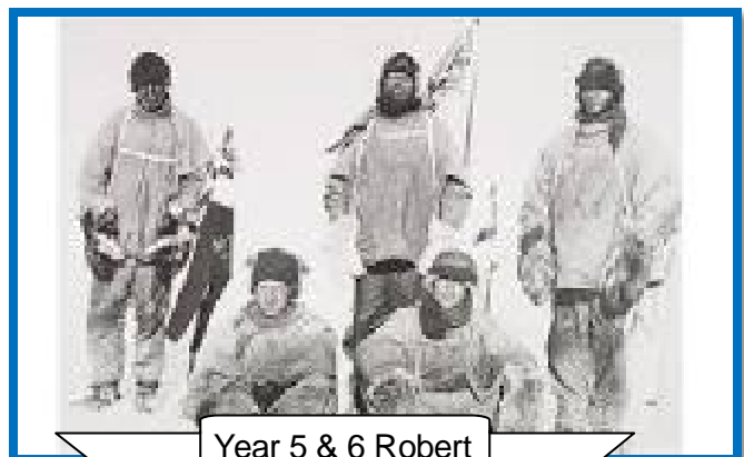
Year 5 & 6 Robert Falcon Scott

Finally, we learned about the truth in the selfless sacrifice made by Laurence Oates. His last words were profound, "I am just going outside, and may be some time."